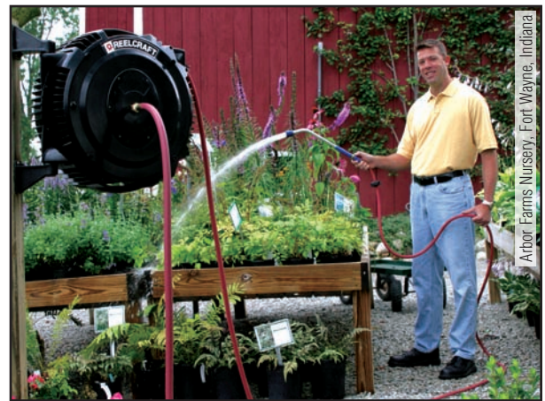
Arbor Farms Nursery, Fort Wayne, Indiana