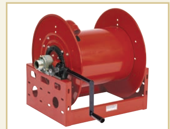
Series 3700 - 2" I.D.