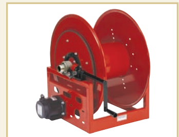
Series 3900 - 1", 1 1/4", 1 1/2" I.D.