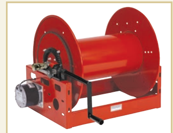
Series 2400 - 1/2", 3/4", 1" I.D.