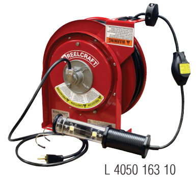
L 4050 163 10