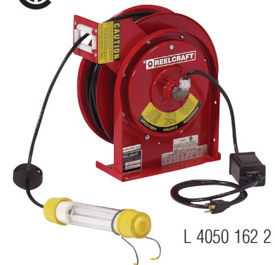
L 4050 162 2