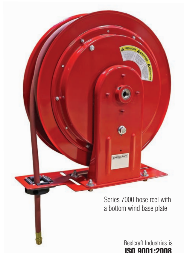
Series 7000 hose reel with a bottom wind base plate

Use reel hole pattern for mounting the reel and plate. Reel mounts to the side of the plate opposite of the rollers. *The guide arm needs to remain on the reel for Series B4000, B5000 and B5005.