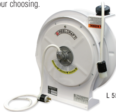
L 5550 123 3A-17WH-WC